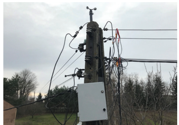
Results were sent from the enclosure across the analyzer's wifi connection